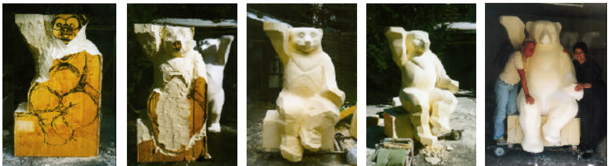
Development of the first sculpture of the new Buddy Bear in a sitting position.

We are looking forward to hearing expressions of interest for the new Buddy Bears. Please call +49-30- 88 77 26 83 for further information.